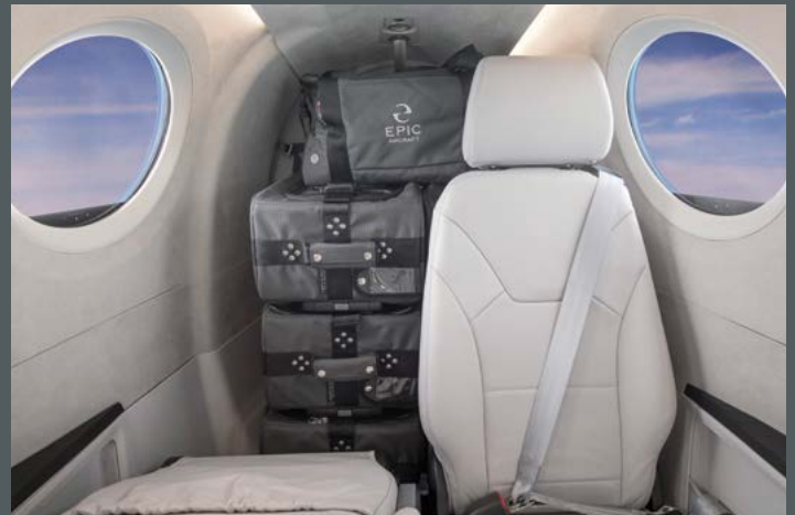
Flexible rear-seating configurations for easy access to aft baggage compartment

With unrivaled cabin comfort, mobility and luxury, the Epic E1000 GX ensures every seat delivers a first-class experience. Whether you're sitting at the controls or relaxing in the rear, the luxurious and spacious hand-crafted interior is a flawless extension of the aircraft's sleek and elegant lines. The spacious cockpit and cabin offer ample storage, easy-access convenience features, technologically advanced soundproofing, and best-in-aircraft-class legroom for both pilots and passengers.